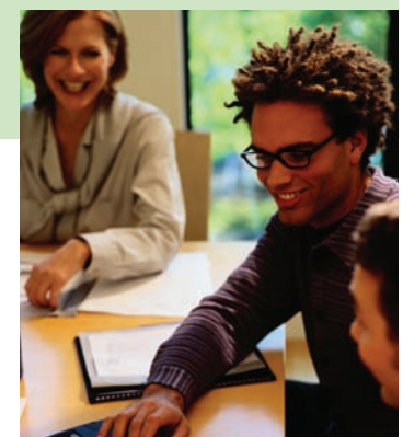
M 2 Provides Unique Value